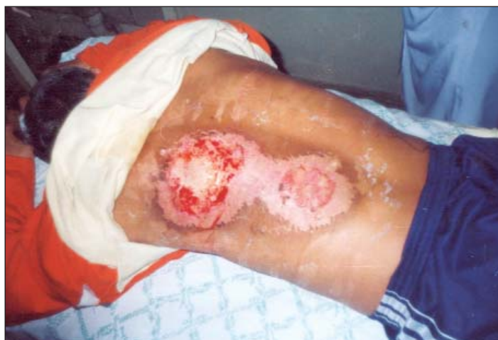
Irradiated. Georgian doctors covered this man's radiation burns with patches that released bacteriophages into the wound as they degraded.

The first whiff of the microscopic predators came in 1896, when British chemist E. H. Hankin reported that water straight from the sewage-ridden Ganges and Jumma rivers could kill the cholera pathogen. It wasn't until 2 decades later that a pair of scientists, working independently, concluded that the bacteria slayers must be microbes themselves. In 1915, British bacteriologist Frederick W. Twort described an "ultramicroscopic virus" that somehow killed bacteria in solution. But it was noted biologist Félix d'Herelle of the Pasteur Institute in Paris who made the critters famous: He and his wife coined the term bac-