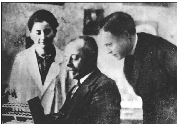
Heady days. Félix d'Herelle (seated) and Giorgi Eliava (right) in Tbilisi shortly before Eliava was shot.

The Soviet military was perhaps the biggest consumer of phage preparations, many of which were produced in Russia—and still are—according to Georgian tech-